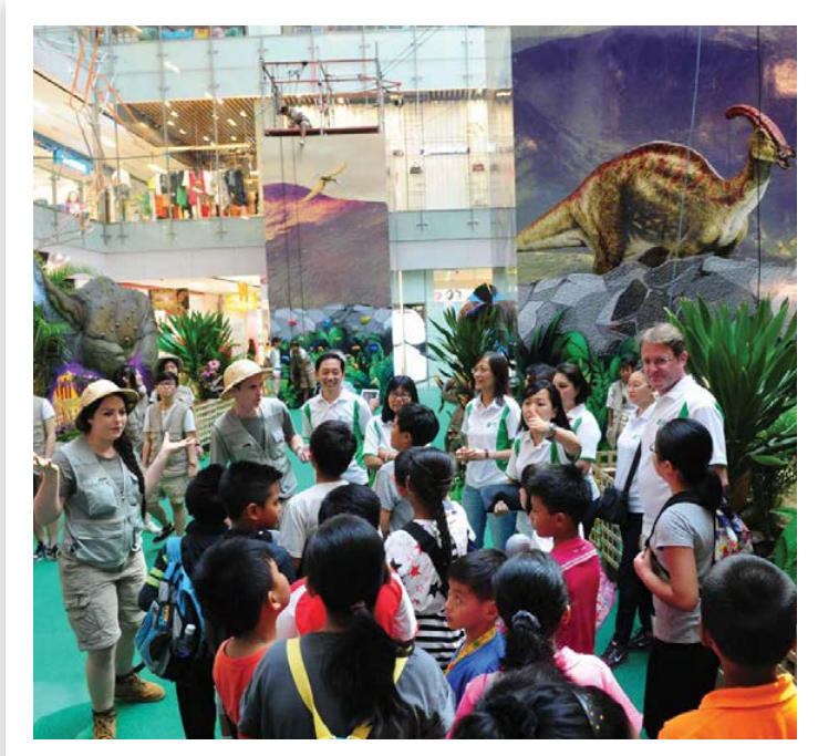
An introduction to dinosaurs by a ranger before the volunteers and children began the Jurassic Challenge at OneKM.

The children enjoyed the adrenaline rush so much that they even wanted to go for another round! After their adventure, the volunteers and children enjoyed more bonding time over pizzas and snacks.