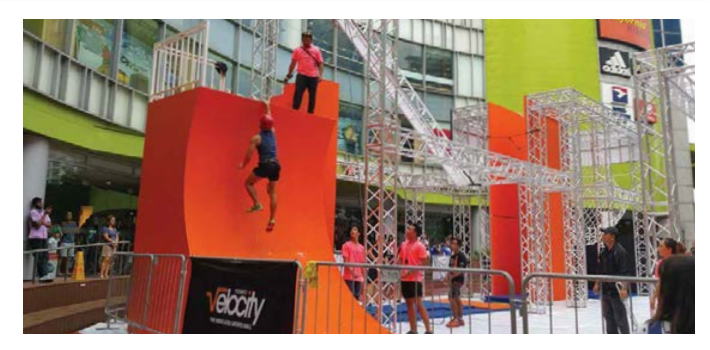
> Urban Attack is a test of one's strength, stamina and determination