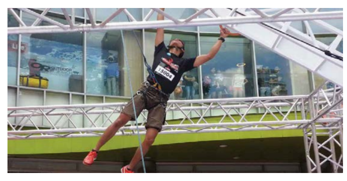
> Conquering the monkey loops with strength and agility

The qualifying rounds were held over the first two weekends of June. Like ninjas, the 194 contenders moved with agility and smart tactics as they sped through the obstacles, drawing audiences to their incredible feats. The battle to the top saw fierce competition where every second counted towards their placings. The grand final was held on 20 June 2015, where the male and female categories each found its top winner, scooping up $1,500 cash and $1,700 worth of shopping vouchers and exclusive products.