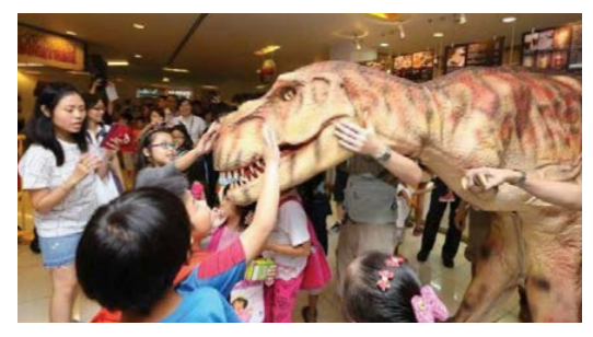
Young children at United Square were fascinated by the dinosaurs.

Over at United Square, younger children were taken on an educational Dinosaur Trail by the knowledgeable rangers. Shoppers with a minimum spend of $80 at either mall were able to embark on an adventure. Both attractions proved to be so popular that snaking queues were a common sight every day.